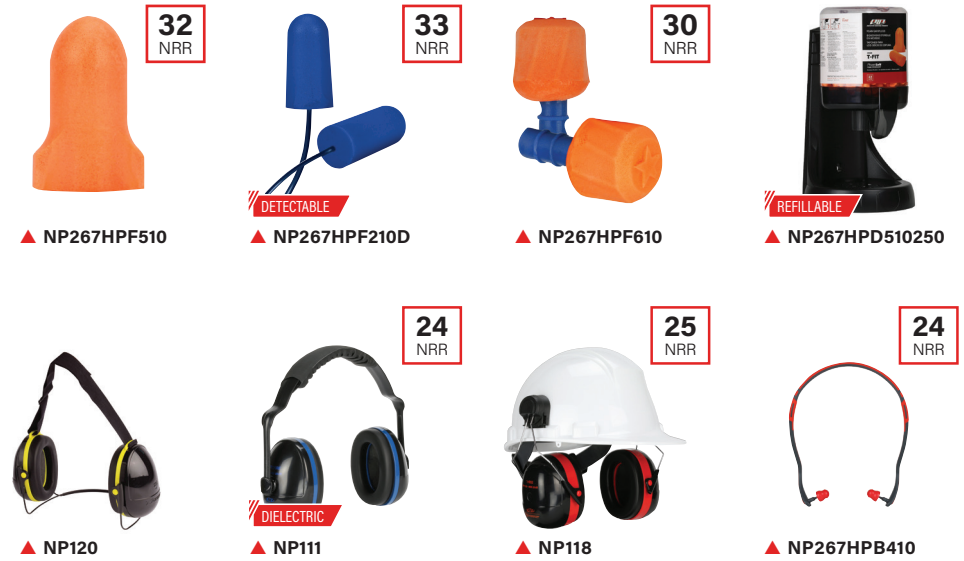
32 NRR ▲ NP267HPF510