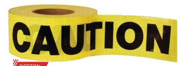
COTTON ▲ PIT3C150YE1

From warning of potential hazards to creating an impediment to help prevent entry to an area, we carry solutions for your needs.