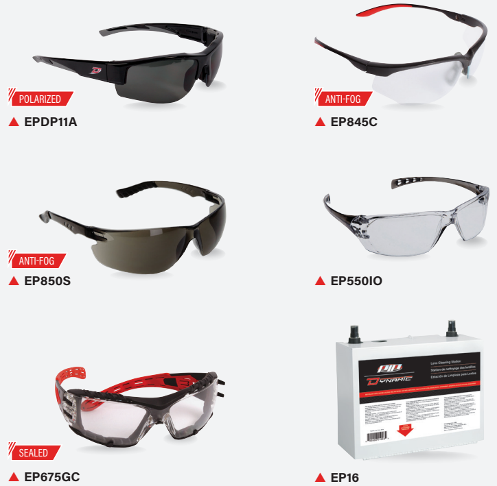
POLARIZED ▲ EPDP11A