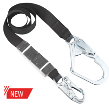
NEW ▲ FP743146