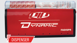
DISPENSER ▲ FADISPR