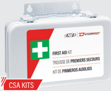
CSA KITS ▲ FAKCSAT1BM