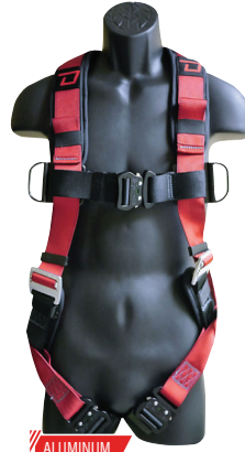
ALUMINUM ▲ FPX1001D