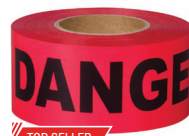
TOP SELLER ▲ PIT315RE1