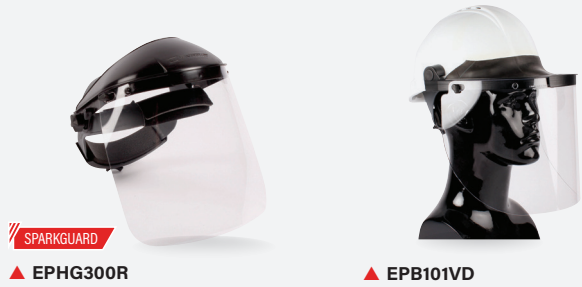
SPARKGUARD ▲ EPHG300R